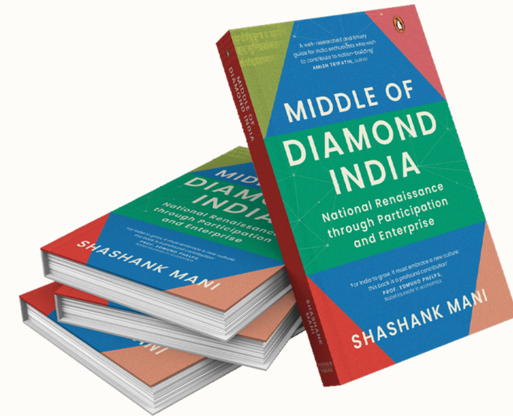
MIDDLE OF DIAMOND INDIA